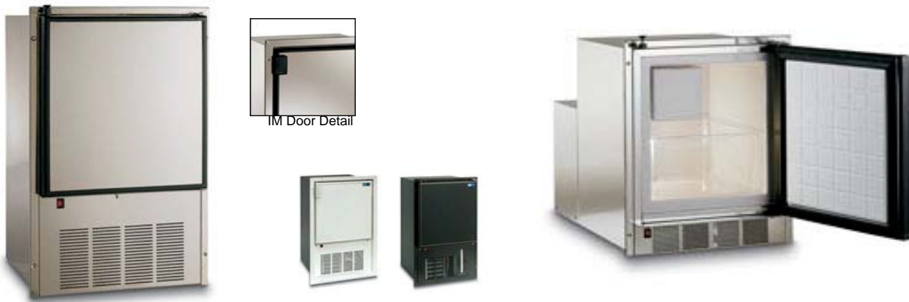
All models also available in Black or White

IM HYDRO XT F1 - Low profile model. Compressor at rear. Requires connection to vessels water supply.